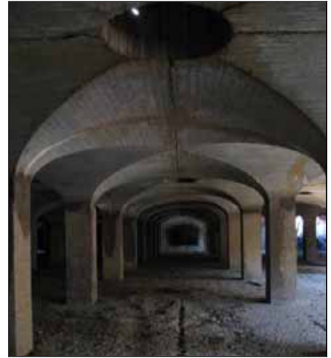
Interior filter bed No. 24