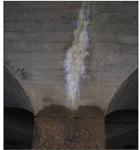
Cracking and efflorescence of concrete structure