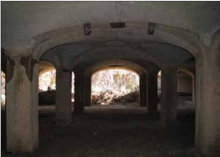
Interior of filter bed No. 24, collapse of eastern cells.