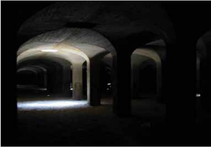
Typical interior of filter bed